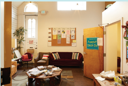
before and after