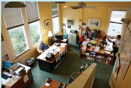
before and after