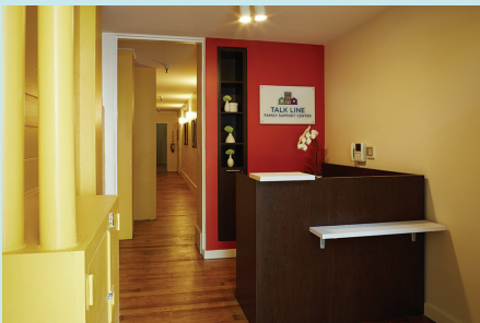
before and after